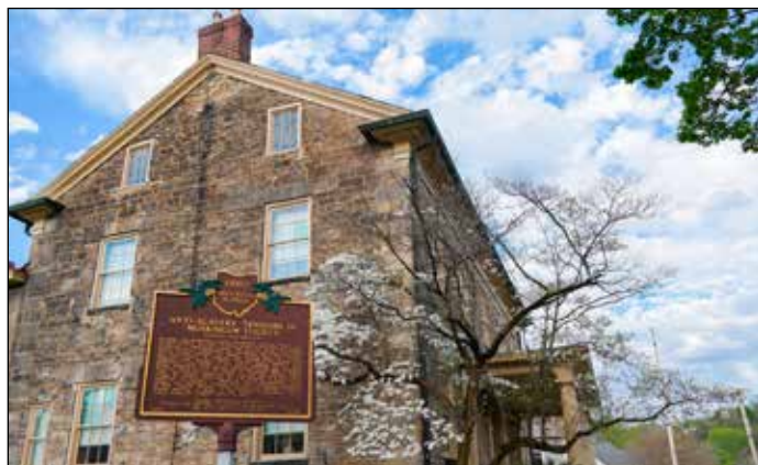
Top: John Stark Edwards House. Bottom: The Stone Academy in Zanesville.

Shade Historical Association. The meeting will begin at the Meigs County Historical Society's new building in Middleport, with sessions on preserving cemeteries and "born digital" photographs. After lunch (and the regional business meeting), attendees will travel to the Chester Shade Courthouse and Academy for a tour and to learn more about the restoration of these historic structures, including lessons learned.