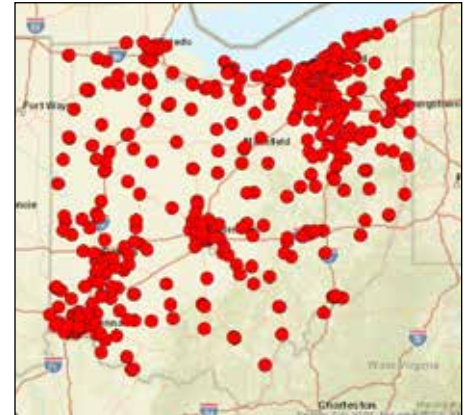
Left: Data from before the REpoData Survey Right: Archives found through the RepoData Survey.

work through an open repository. You can read more about the project in a recent issue of Archival Outlook .