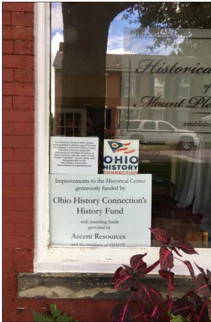
Top: Nestled among the bushes at the east side of the historical center is a unit that is a part of the society's new climate-controlling HVAC system. Bottom: A sign about the Ohio History Fund project graces the front window of the Historical Society of Mount Pleasant.

contemporary use while preserving those portions and features of the property which are significant to its historic, architectural, and cultural values." The Alliance Historical Society has been a member of the Ohio Local History Alliance since 1989.