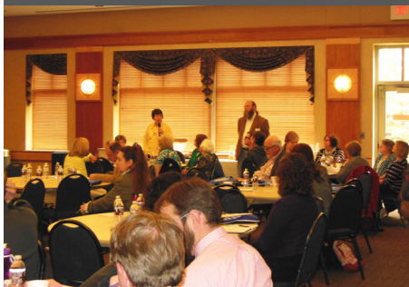
Sharing Time is always a popular part of every Regional Meeting.