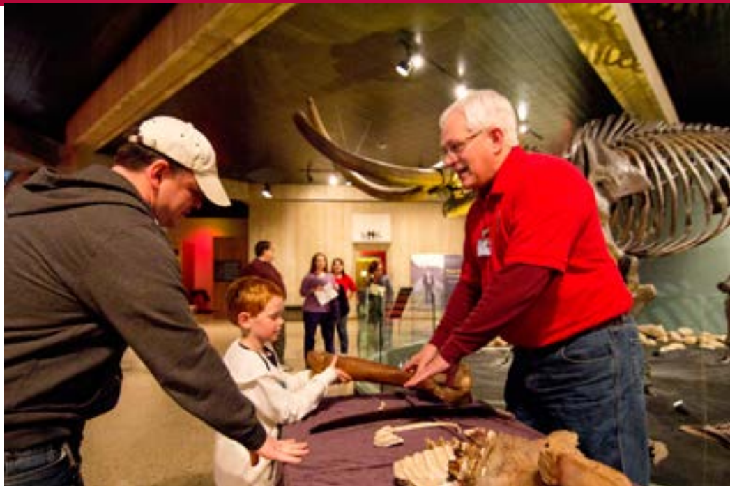
Knowing your target audiences (like families) and interacting with visitors all help to make your museum a more welcoming place.

Map your audience's access points: Plan for how you will engage people before, during, and after their visits. Will you reach out through social media, advertisements, posters, or other forms of communication? Web pages should