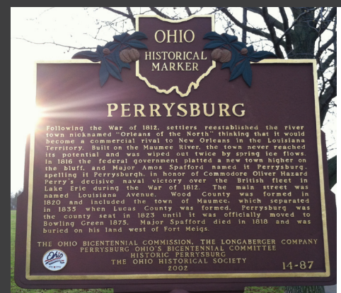
Ohio Historical Marker about Perrysburg, erected during the state's bicentennial commemoration.

The deadline for grants for Ohio Historical Markers is October 1. Grants offset the cost of markers up to $750, and it is easy to apply. Just check the box at the top of page one the marker application form and, viola, you have turned your form into a grant application. For an application, visit www.remarkableohio.org and click on "Propose a Marker" on the left side of the screen.