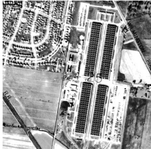
Gentile AFS, 1949 (Historic Image 1)

In addition to Wright and Patterson fields, a smaller Army Air Force installation was located in Van Buren Township. Beginning in the 1920s as another Johnson Flying Field, the facility eventually became an Army Air Force Depot. During WWII, Italian prisoners of war were housed at the installation. It was renamed Gentile Air Force Station (AFS) after the war. The station was essentially an Air Force office park, housing several different organizations, but the largest was the supply center. The 55-acre Gentile AFS eventually contained several dozen buildings, but the four massive supply buildings dominated the facility.