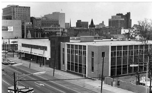
Dayton and Montgomery County Public Library, 1962 (Historic Image 9)

Libraries have been an important component of education for the community. Dayton organized the first library association in the state of Ohio in 1805. (Zumwald 12) The Dayton Public Library's 1887 building in Cooper Park was replaced, after many earlier attempts, with the current facility in 1962. A year after the new main library's opening, the author of Dayton: Gem City of Ohio praised the building for its aesthetics and its contribution to Dayton's progressive cultural amenities. "The new library, opened Mar. 26, 1962, is more than a beautiful and efficient center for cultural growth. It is a symbol of the renewal that makes Dayton and Montgomery county a fascinating area in which to reside and work. It is another reminder of the city's determination to keep abreast of the tremendous national and international developments." (Sanders 80)