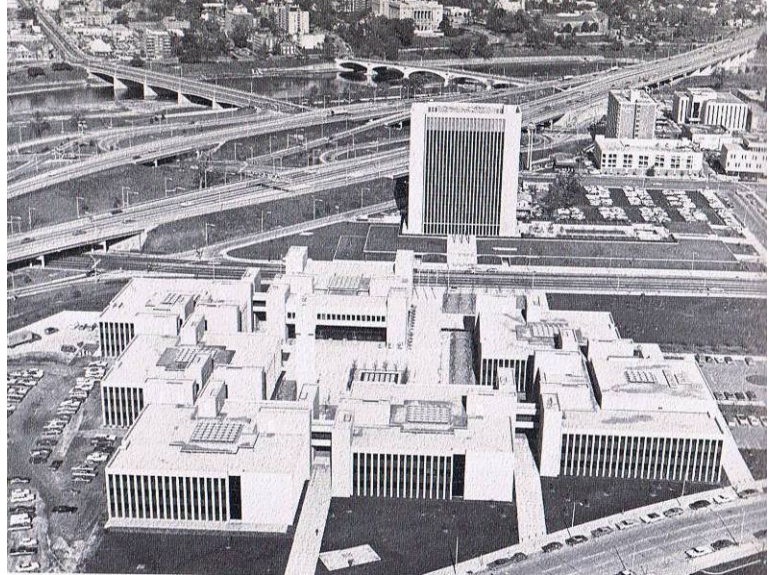
Sinclair Community College and the Montgomery County Administration Building in the background (both designed by Edward Durell Stone), 1975 (Historic Image 8)

Edward Durell Stone of New York was named the architect of the new Sinclair Community College campus in 1967. On twenty acres of urban renewal area once proposed for sports arena and hotel development, construction began in 1969. Recognized as one of the United States' leading proponents of the International Style, Stone designed a number of well known buildings, such as the John F. Kennedy Center for the Performing Arts in Washington D.C. Among his higher education designs are the medical center at Stanford University, the State University of New York, Albany, the Harvey Mudd College in Claremont, California, and the medical center at the University of Arkansas. Stone's design for Sinclair Community College included a unified complex of attached structures, occupying several blocks, which are linked above and below ground. Seven buildings, arranged around a central plaza, were opened for classes in September, 1972 (MOT-05202-15, MOT-05203-15). Since then, the campus has grown to 55 acres and 20 buildings. In addition to the main campus, Sinclair offers classes at four auxiliary locations, six neighborhood locations, and on-line. Currently, the school offers over 150 academic programs and serves nearly 23,000 students.