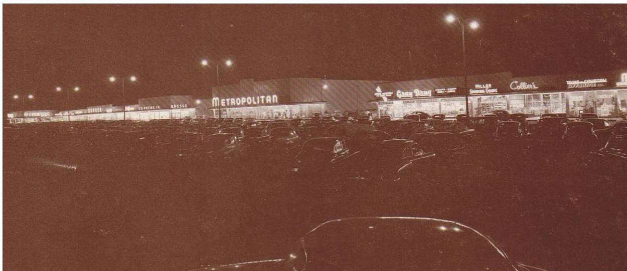
Town & Country Shopping Center, 1950s (Historic Image 2)