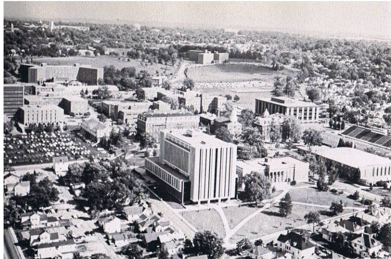
1975 Aerial view showing the extent of mid-20 th -century buildings added to the campus. Roesch Library is in the center.