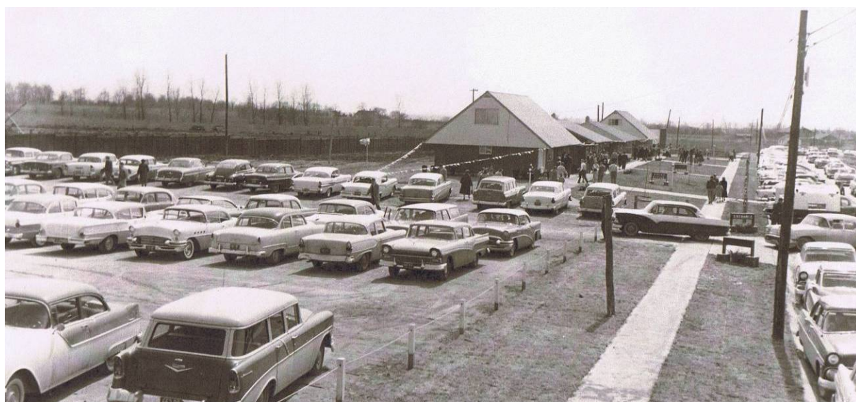
Huber Homes Open House, ca. 1960 The Ohioan model is seen in the background. (Historic Image 3)

Expansion of the Huber Heights development, as well as the product and reputation of Huber Homes was swift. Beginning with the Midwesterner (MOT-05598-14, MOT-05633-14) and the Highlander (MOT-05626-14), the basic three-bedroom Ranch model that could be found in the earlier Kettering subdivision, Huber launched two more models in 1959. The Cape Cod style Ohioan model (MOT-05597-14) and the L-shaped Suburban model (See Historic Image 54. Appendix B) were Huber's other two early house types. Dubbed "the Big Four for 1959," the houses were unveiled at an April 5 th gala, hosted by the 1958 Mrs. America pageant winner. "By hostessing the Huber Heights opening, the country's number one wife and mother is expressing her confidence in the company which will construct the official 1959 Mrs. America Exhibition Home." (The Hub 4)