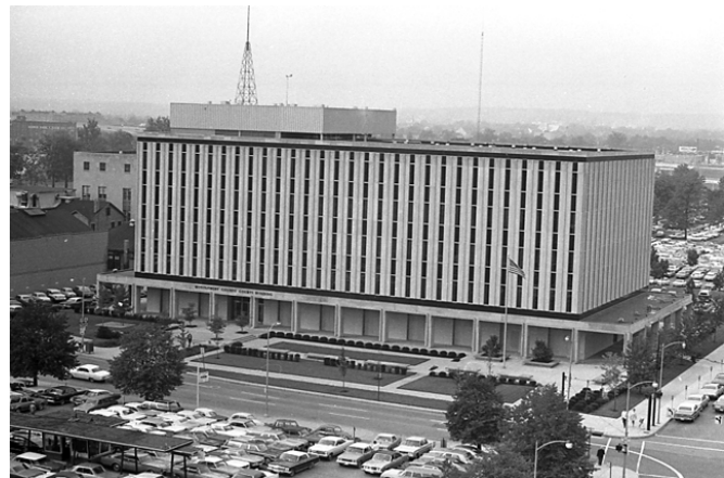
Montgomery County Courts Building, 1969 (Historic Image 6)

The western edge of the central business district was downtown Dayton's second urban renewal area. (See Historic Image 57, Appendix B) A large swath of ca. 1900 housing had been demolished in this area for the coming of the interstate, including an interchange, and new commercial and governmental buildings. The renewal area began just west of the Dayton Safety Building, 335 W. Third Street, which had been completed in 1955 (MOT-05152-15). The Dayton Safety Building was the first of three governmental buildings that were constructed in the location proposed in the 1946 Civic Center Plan. (See Historic Image 52, Appendix B) The next completed building, in 1961, was the Montgomery County Court Services at 303 W. Second (MOT-05151-15), followed in 1965 by the Montgomery County Courts Building at 41 N. Perry (MOT-05372-15). In 1975, a federal building had been completed in the central space that was dedicated for a landscaped parking lot.