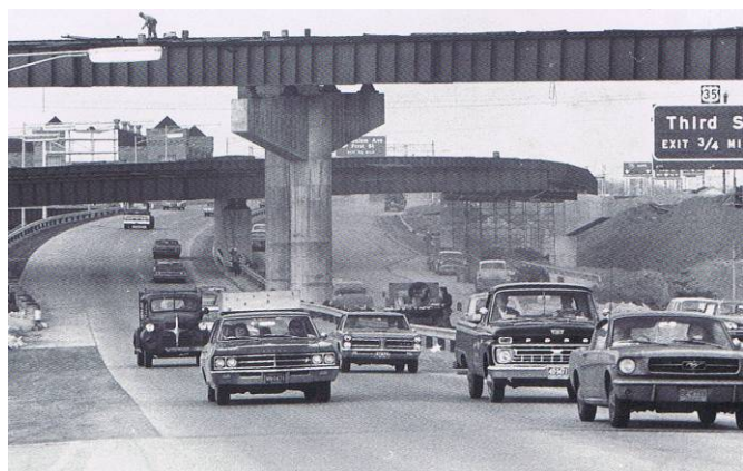
I-75 through downtown Dayton, ca. 1966 (Historic Image 4)

In Dayton, the first of the new limited access highways to be completed was actually a state route. In 1961, S.R. 4 was finished in advance of the interstates that it would connect. Interstate 75 was completed in sections through the early 1960s, and finally completed through downtown from I-70, 10 miles north to south of the city in 1966. The section of I-70 connecting the northern metro area to the Indiana line was completed in 1964. Although I-675, the city bypass, was