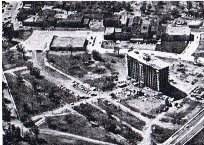
Aerial view of East Dayton Urban Renewal Area showing Dayton Towers near completion, 1963 (Historic Image 5)

During the 1960s, the city continued to focus its attention on the core downtown. The East Dayton Urban Renewal was underway and in 1963, the City Commission Office, pleased with the results, reported, "Dayton is deeply involved in a process that promises a new day for our city, and a new life for our citizens. This process is called Urban Renewal." (City Commission Office, 1963 12) That year the Dayton Towers (MOT-05159-57) high-rise apartment building was completed, and a new downtown post office (MOT-05160-57) was completed in