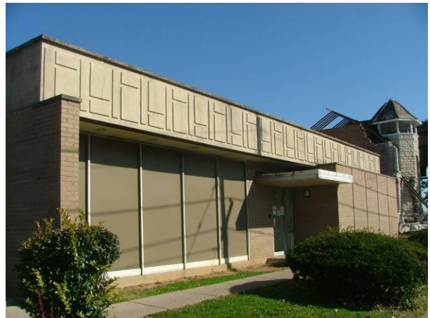
Burroughs Corp. Business Machines 131 Salem Ave., Dayton