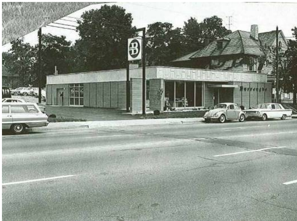
Burroughs Corp. Business Machines, date unknown (Historic Image 18)

The Burroughs Corp. (MOT-05291-43) conducted a business machine manufacturing and retail operation in this building constructed in 1964. Located just north of downtown on a busy corridor, the company is in the vicinity of several mid-20 th -century office and institutional buildings. It is of note that the company located its manufacturing facilities close to downtown during a time when most manufacturers, both large and small, were relocating to the edge of the city or to the suburbs.