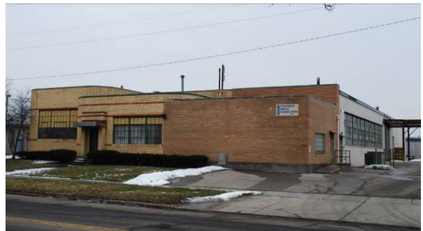
Reich Machinery Rebuilding Company 1272-80 McCook Ave., Dayton

Representing one of the earlier buildings in the McCook Industrial Park, the former Reich Machinery Rebuilding Company (MOT-05508-48) building was constructed in 1946. From 1951-70, the Dayton Machine Tool Co. was located here. Both businesses represent Dayton's metal fabrication and tool and die industrial sectors, a component of the city's industrial heritage since the 19 th century.