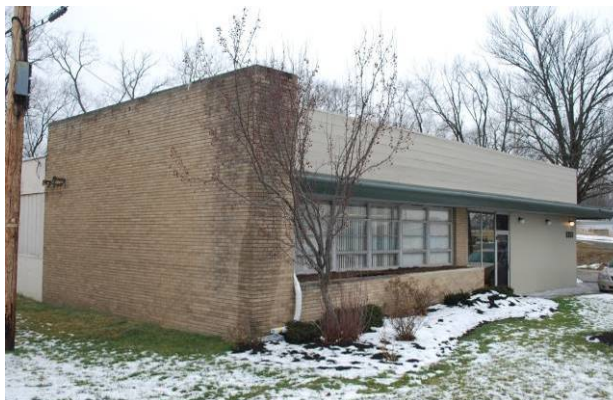
Metallurgical Services, Inc. 1353 Stanley Ave., Dayton

Located in McCook Industrial Park, this building, constructed in 1953, represents a small-scale industrial concern. From 1955 until 1967, it was occupied by Metallurgical Services, Inc. (MOT-05515-48), which provided heat-treating services.