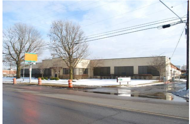
Stanley Greetings, Inc. 1752 Stanley Ave., Dayton

Another entrant in Dayton's printing and publishing sector, Stanley Greetings, Inc. (MOT-05510-48), a greeting card publishing company still in existence as Vagabond Creations, was located here from the building's construction in 1950 until 1953. In the 1960s, the building was occupied by Master Consolidated, a manufacturer of oil-fired space heaters, portable power tools, and tractor-drawn farm equipment.