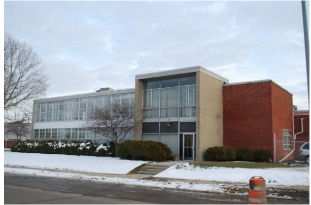
Globe Industries, Inc. 1784 Stanley Ave., Dayton